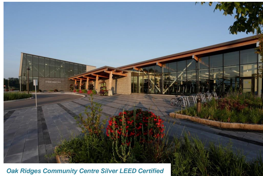
Oak Ridges Community Centre Silver LEED Certified

Note that Block Plans are not relevant to the City of Richmond Hill, in addition, there are some metrics not applicable to the City and those have been greyed out in the tables within the guidebook.