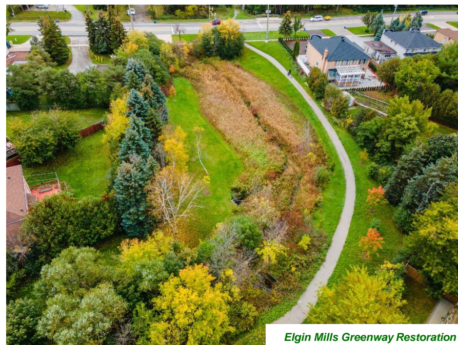
Elgin Mills Greenway Restoration